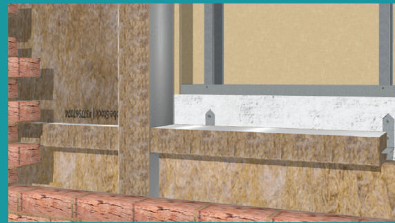
*When installed in accordance with the tested build up **When compared to the CCL Fire Stop Slab range

The CCL CFSS range has been tested in accordance with EN 1366-4, 2021.