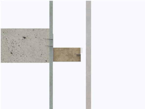
Side view showing rainscreen barrier held in place by the unique retaining bracket